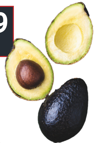
Avocados by the Bag Product of Mexico Loose $0.79 ea