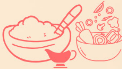
Mashed Potatoes, Vegetables, Stuffing & Gravy