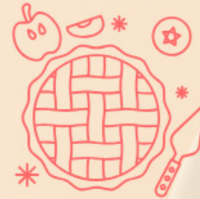
8" Apple or Pumpkin Pie