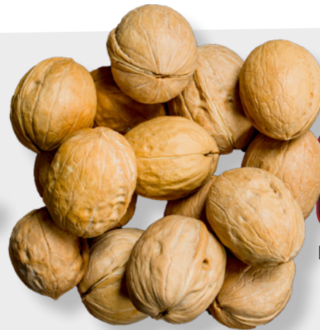
In Shell Walnuts