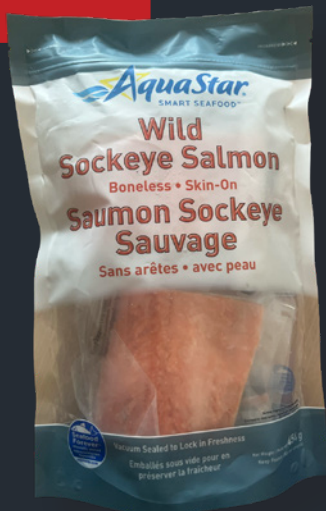
Aqua Star Wild Sockeye Salmon 454 g