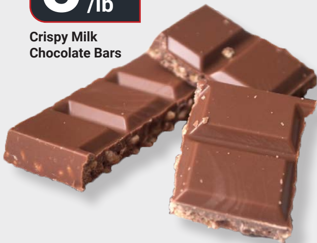
Crispy Milk Chocolate Bars