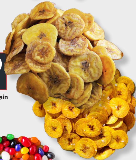
Banana or Plantain Chips