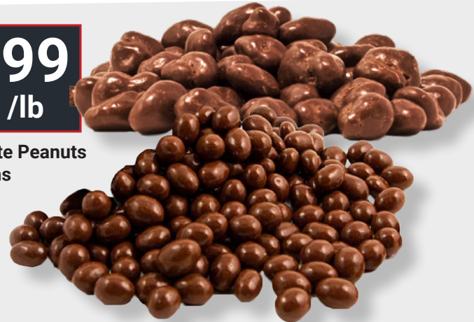
Chocolate Peanuts or Raisins