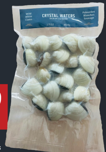
Crystal Waters Wild White Clams 454 g