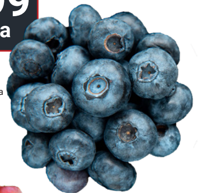
Blueberries 1 Pint Product of Florida