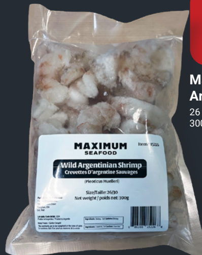
Maximum Wild Argentina Shrimp 26 - 30 pieces 300 g