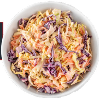
Coleslaw Store Made